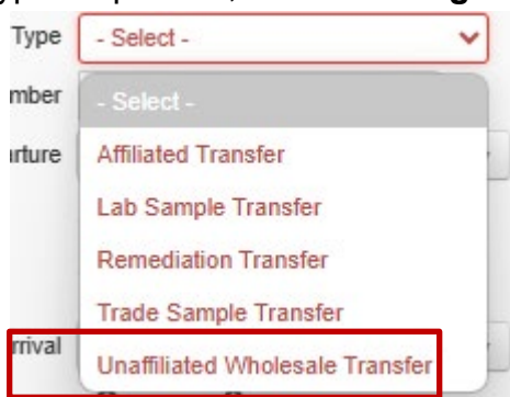
Figure 2: Unaffiliated Wholesale Transfer Option

This button will prompt an action window to appear. Then, select the “Unaffiliated Wholesale Transfer” option in the Transfer Type drop-down, as seen in Figure 2 .