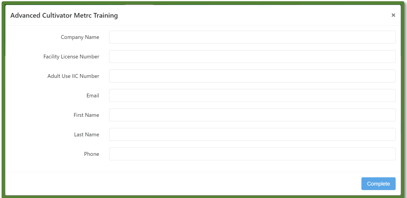
Figure 3: Registration Screen

Once all the information is submitted, and your information is verified, you will receive an email with the registration confirmation.