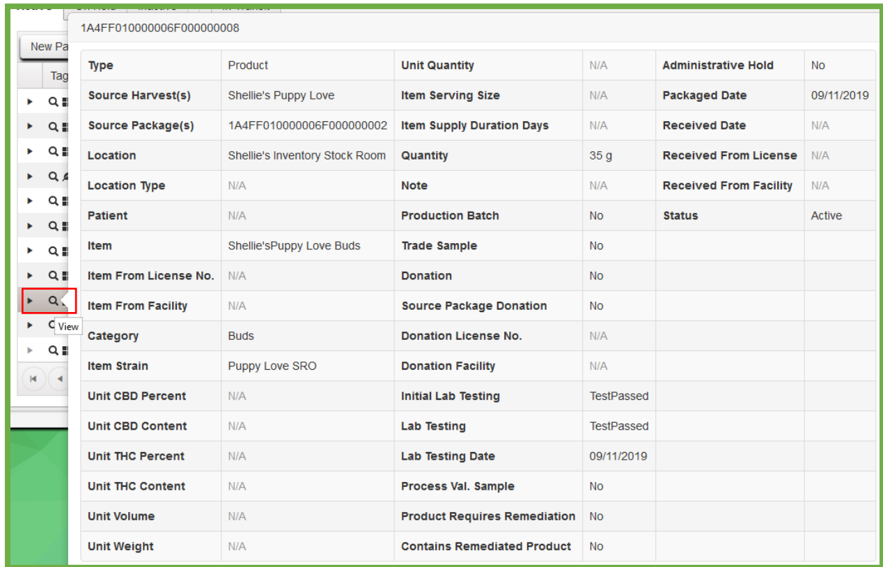
Figure 1: Updated Table View When Hovering Over a Package

When hovering over any magnifying glass in Metrc, a user will now see the updated table view as shown in Figure 1 outlining the relevant information that is currently associated to the record. In addition to the new view, users will now notice that Metrc has incorporated dynamic positioning of these tables. Meaning, if the mouse is on the left, the display will appear on the right of the screen. If it is on the top, it will appear on the bottom.