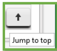
Figure 3: Scroll to Top of Screen