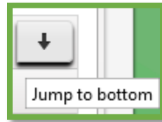
Figure 2: Scroll to Bottom of Screen

All grids in Metrc have been updated to include two new buttons on the far right of the interface. These scroll buttons allow users to select to jump to the top or bottom of the respective page that they are on as shown in Figure 2 and Figure 3 below.