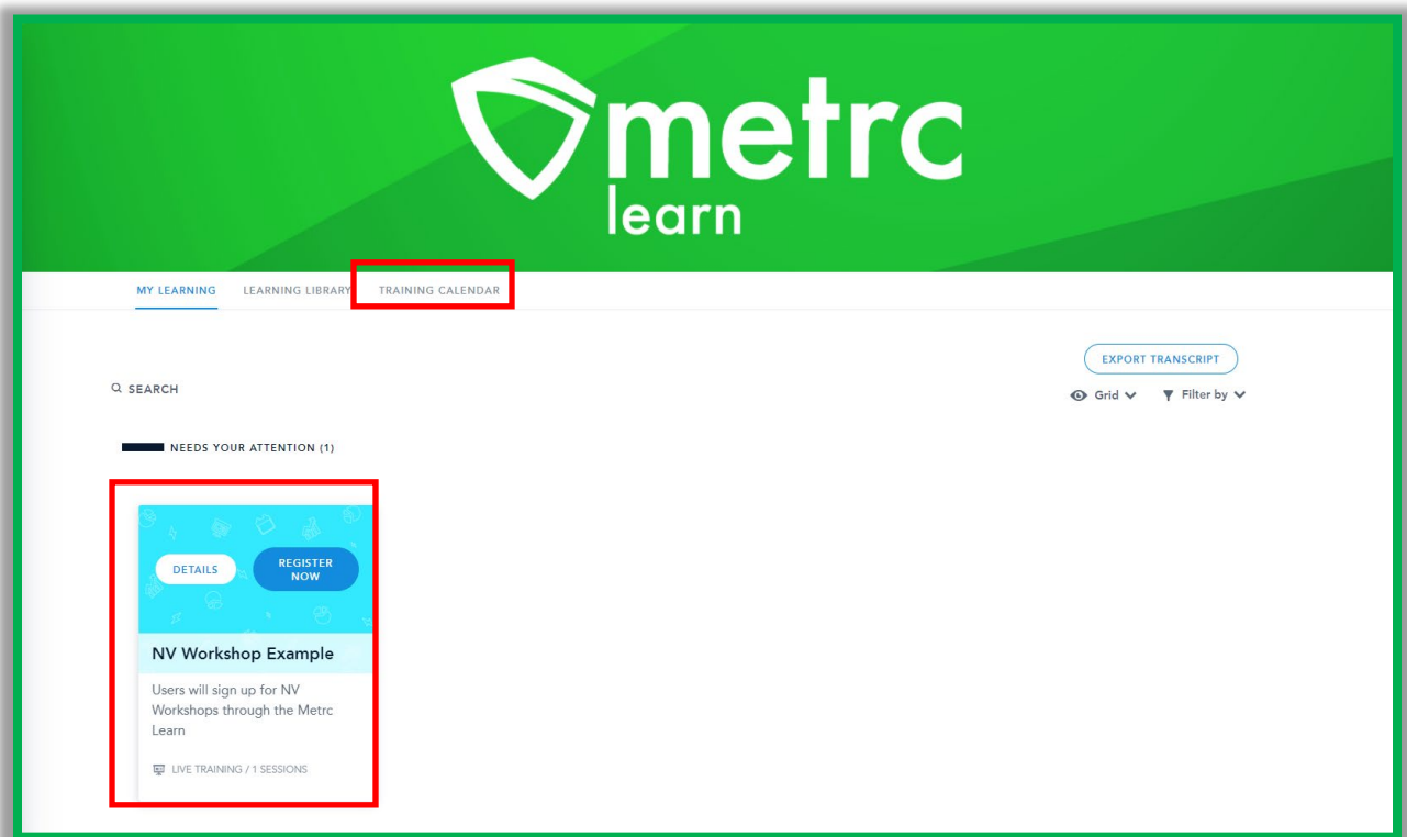
Figure 1: Training Calendar to Choose a Workshop from a Metrc Learn Account

For any users that ALREADY have a Metrc Learn account, NV Workshops can be registered for by selecting the Training Calendar tab in the Metrc Learn account and clicking on the “REGISTER NOW” link for the specific workshop the user wants to attend as shown in Figure 1 .