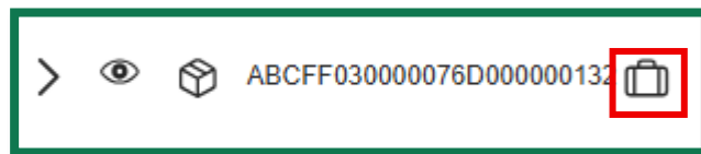
Figure 2: Trade Sample icon

Once a package has been created as a trade sample, that package will display an icon in the shape of a briefcase. This allows for easy identification of trade samples on transfer manifests and within the packages grid – see Figure 2.